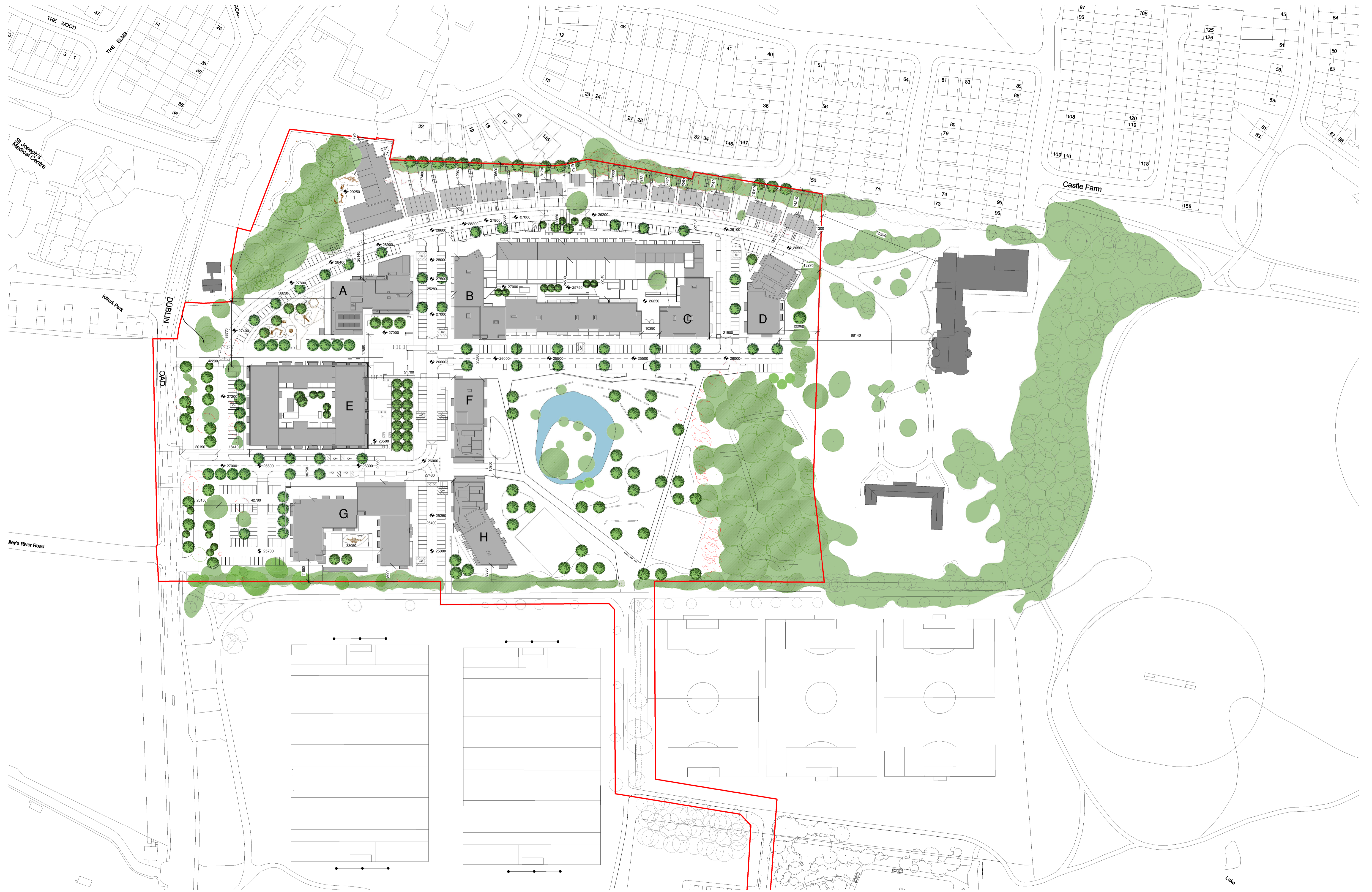
1 Site Layout 1:1000